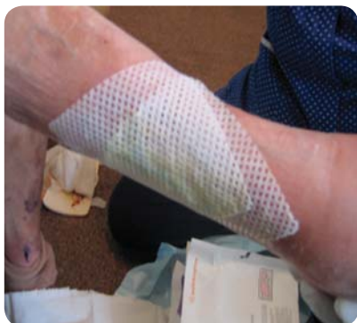
Figure 4. Mesitran Mesh used to treat skin tear.

sutured with numerous Steri-strips, a pad and bandage (Figure 2).