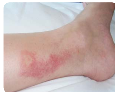
Figure 7. Irritation secondary to possible insect bite.