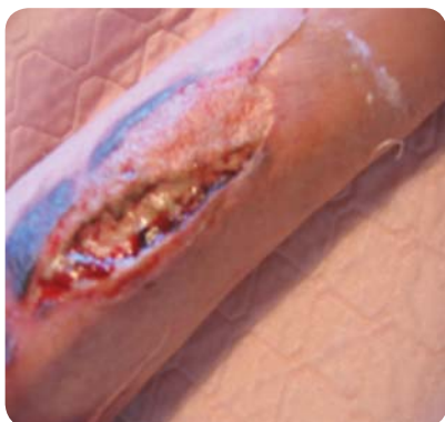
Figure 3. Necrotic tissue in the wound seven days after initial treatment.