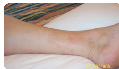
Figure 8. Three days after treatment.

The significant anti-inflammatory effect could be seen within three days