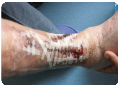
Figure 2. Skin tear following initial treatment in A&E.